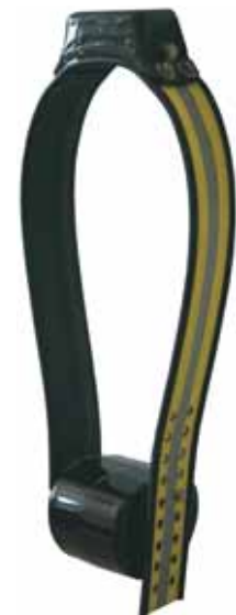
GPS PLUS Collar