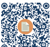
Download the Manual for GPS PLUS X

Refer to the manuals for further information and assistance. If in doubt, feel free to contact VECTRONIC Aerospace customer support. For news about firmware updates or anything else regarding our products please subscribe to our newsletter or contact us directly!